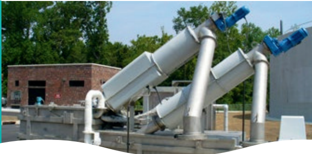
Optional insulation and heating system available for outdoor/cold climate applications.

To improve the overall performance of the Raptor ® Complete Plant and to improve the downstream process operation, the grit chamber can also be equipped with an optional grease trap. Excess grease can be removed manually or a motorized skimmer can be provided.