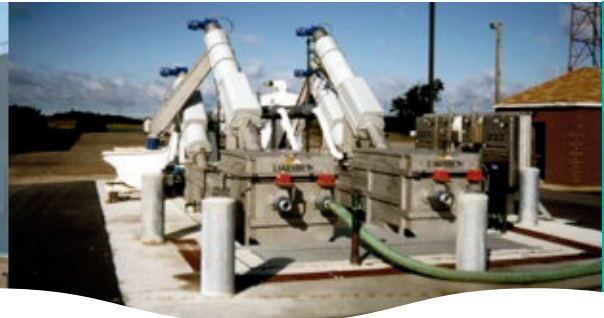
The Complete Plant can be designed with a hook-up for disposal of tankered septage.