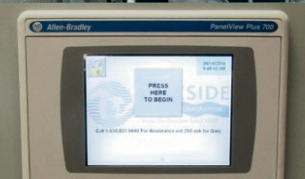
RACS Station for Security Access