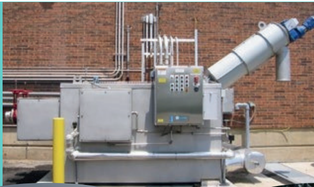
Weather Protection Package

The septage hauler receives a printout of the load details, including date, time, hauler name, waste type, total gallons uploaded, elapsed time for unloading and any faults incurred, if applicable.