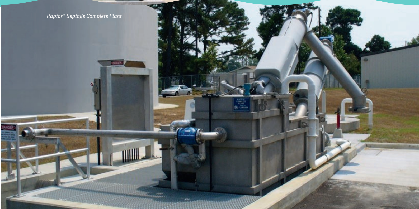
Raptor® Septage Complete Plant