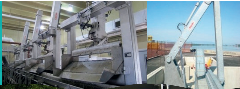
Hydronic T Screen with Wash Press