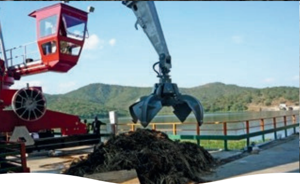
Orange Peel Grapple