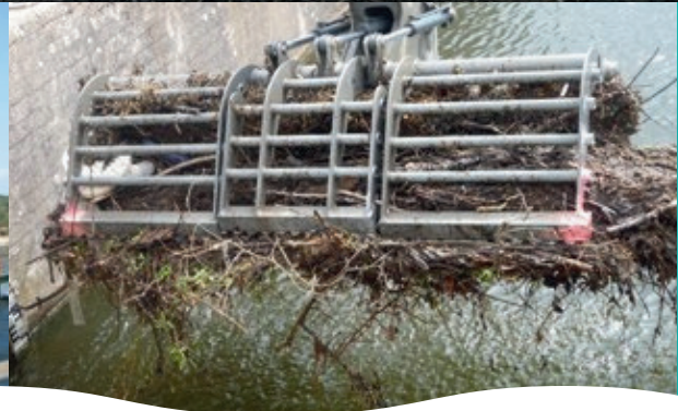
Triple Jaw Grab Rake