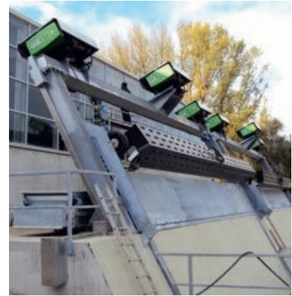
Stationary Catronic S

The Monorail Series Trash Rake is designed specifically for water intake structures, stormwater facilities and wastewater treatment plants. It combines screening and transporting into one unit with an overhead monorail, traversing trolley with grab rake, and a control system.