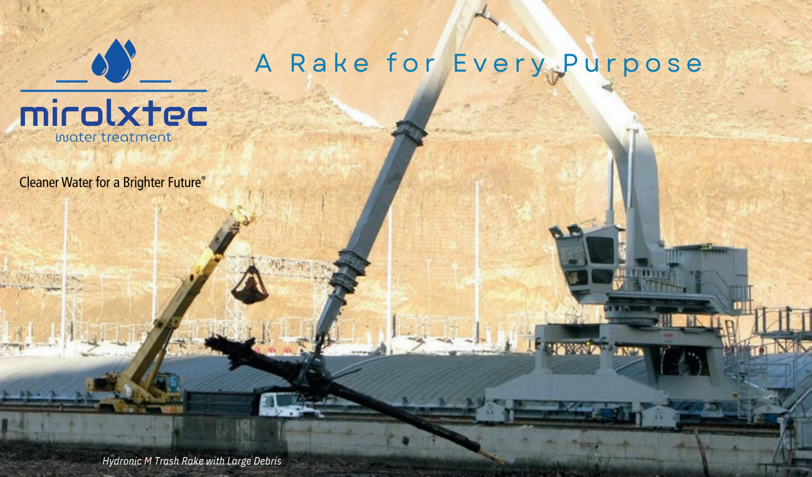
Hydronic M Trash Rake with Large Debris